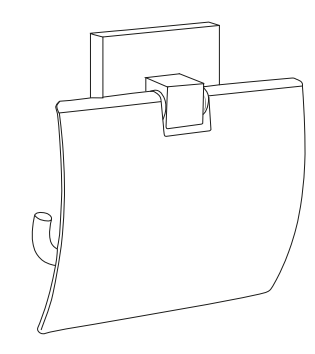
MINCIO™ Tissue Holder