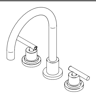
SALONE™ Roman Tub Set