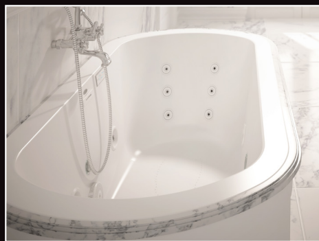
Drop-in installation option