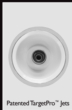
Patented TargetPro™ Jets