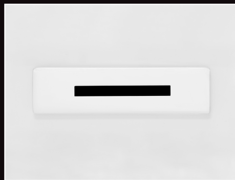
Sleek linear overflow