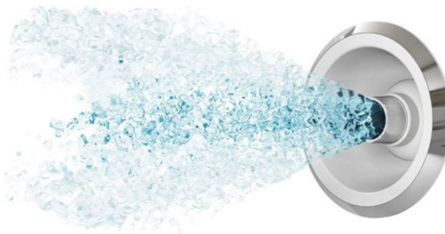
Patented TargetPro™ Jet