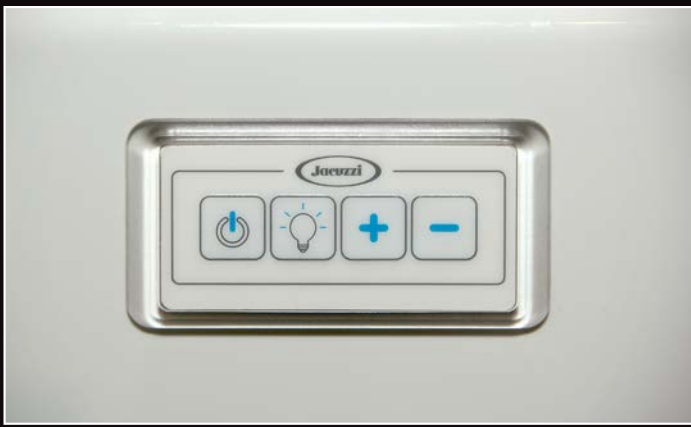
J2 Whirlpool Control