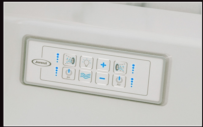
J4 Salon® Spa Control